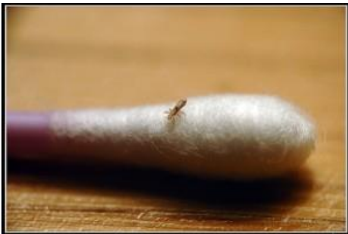
Size of an adult louse on a cotton-tipped applicator.

The adult louse is about the size of a sesame seed, has six legs with claws, and is usually tan to grayish-white but can be dark brownish. In dark hair, the adult louse will appear darker. Females are larger than males and can lay up to 8 nits per day. Adult lice can live up to 30 days on a person's head and need to feed on blood several times daily. Without blood meals, the louse will die within 1 to 2 days.